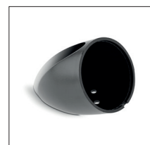
Tilted mounting frame: Easy to install